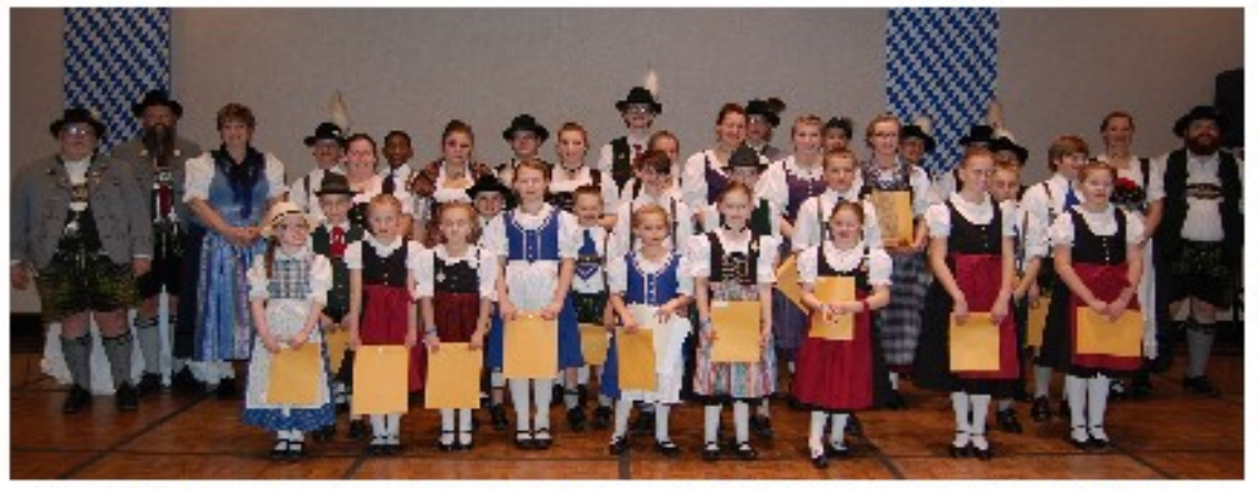
The 33 children 5-17 who participated in the dance exhibition and competition, along with the judges and those who run the dance event.