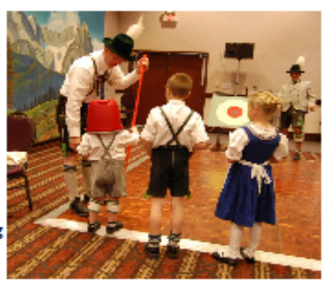
The kids loved the Bockstecken game. Who wouldn't like to put a bucket on their head, spin around, then aim a broomstick at a target?

dedicated to learning new dances, both Schuhplattler and Bavarian Volkstänze. Another workshop concentrated on hairstyles appropriate for the ladies when wearing traditional Tracht. A fifth workshop gave those attending a chance to play some old-time games like Bockstecken and